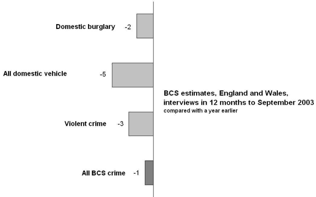
Figure 1 British Crime Survey estimates, interviews in the 12 months to September 2003 compared with a year earlier, England and Wales